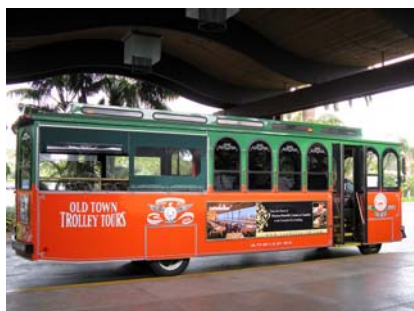
Left: Old Town Trolley, sponsored by the MLA/SCC chapter, waits to transport conference attendees to Old Town and other destinations

By Blair Whittington, Brand Library & Art Center