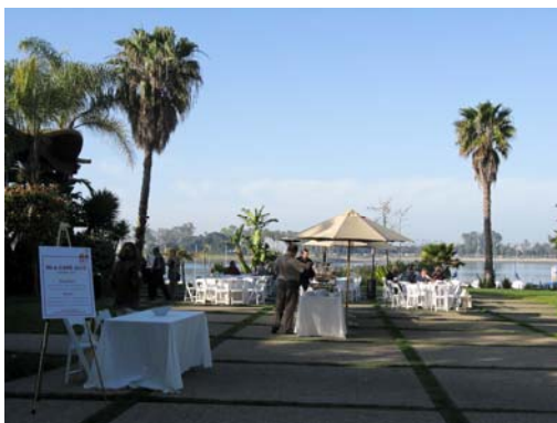
Left: MLA Café overlooking the bay

By Alyssa Resnick, Glendale Public Library