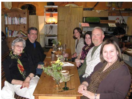
MLA/SCC members and friends enjoy dinner at a local Mexican restaurant