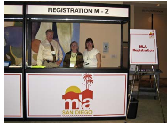
MLA/SCC members help run the registration desk

I'm sure many of you have received the same kind of compliments that I have: "Thank you, thank you, for designing a memorable MLA experience! This was one for the record books." And the LAC did it despite very challenging times for fundraising and attendee travel budgets. The meeting was a long time coming with lots to do. Thanks to the teams who came through so well for the logo, website, the skit in Chicago, and the registration desk. My personal thanks to the San Diego colleagues who helped with everything, including shuttle planning, MLA Big Band instrument rentals, and conference bag stuffing.