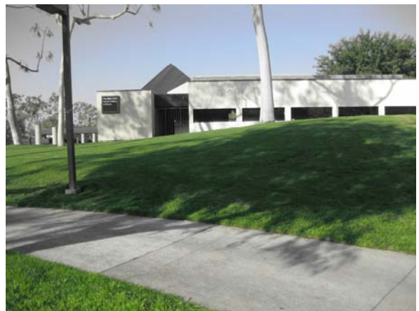
The Bob Cole Conservatory of Music